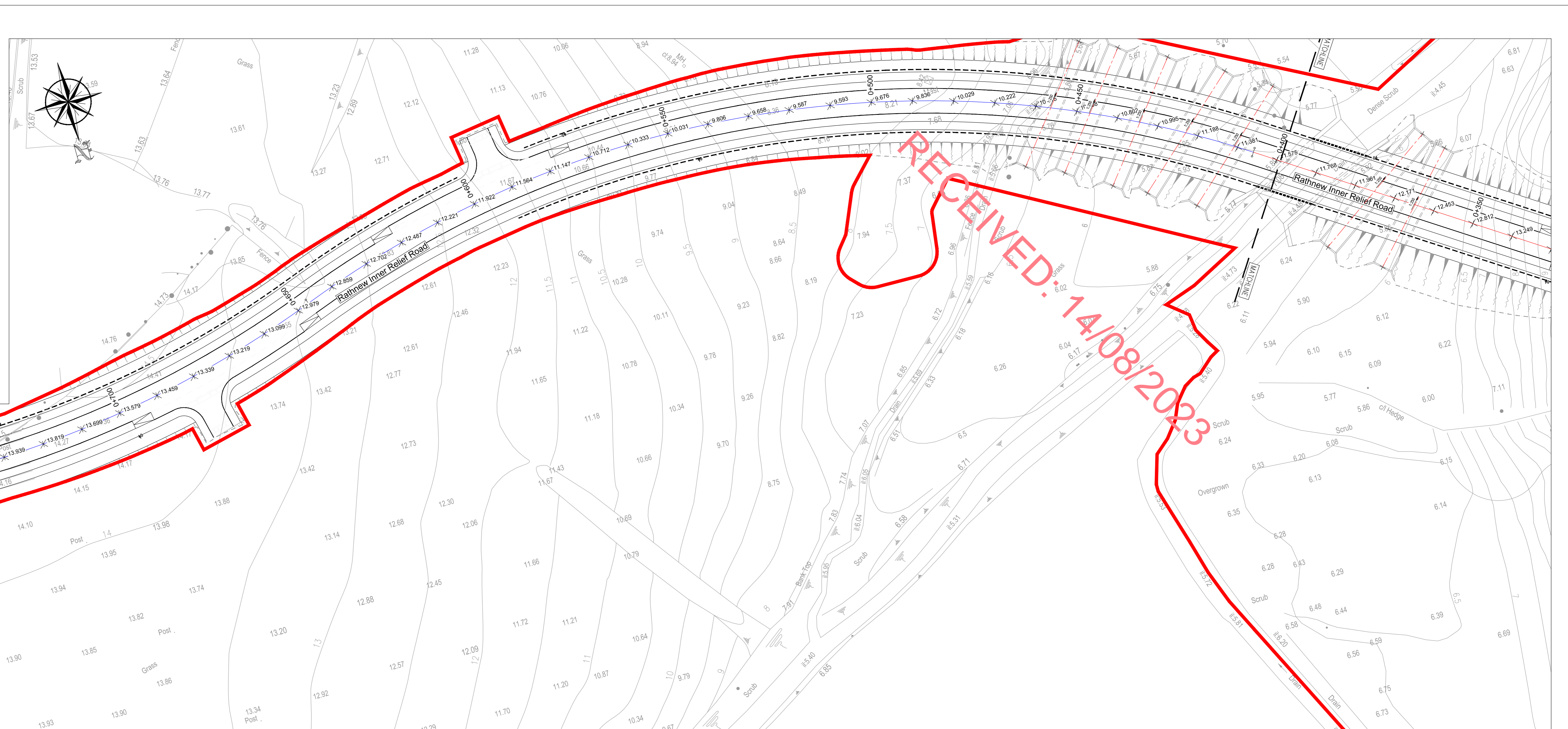
ALIGNMENT=LINK ROAD PHASE 2. SCALE 1:500